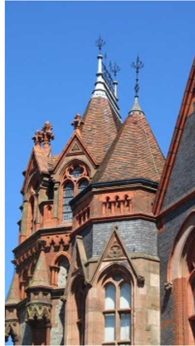
A range of traditional building materials in Reading

We have also included several international heritage news releases which we also hope you find interesting.